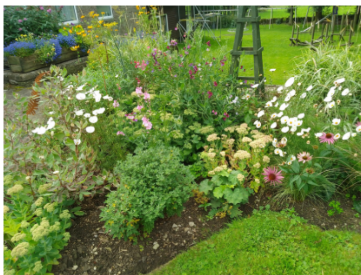
Beautiful Surroundings: Flowers at Last Year's Summer School.