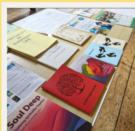
GA Annual Meetings info table from our service on the 21st